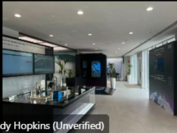
Wendy Hopkins (Unverified)

We bring IBM Quantum to life with an installation of a model of the IBM Quantum chandelier, along with immersive audio of the sounds of Quantum, taken from the IBM Q computation center in Poughkeepsie where the commercial Quantum systems used by the IBM Q Network are located. We also have an accompanying video of IBM Quantum System Two so we can also showcase these next gen IBM Quantum Computers.